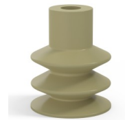
Variant reference: 83 30CN A