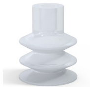
Variant reference: 83 30SLT A