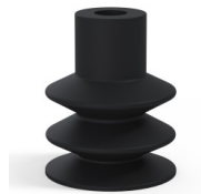
Variant reference: 83 30NI A